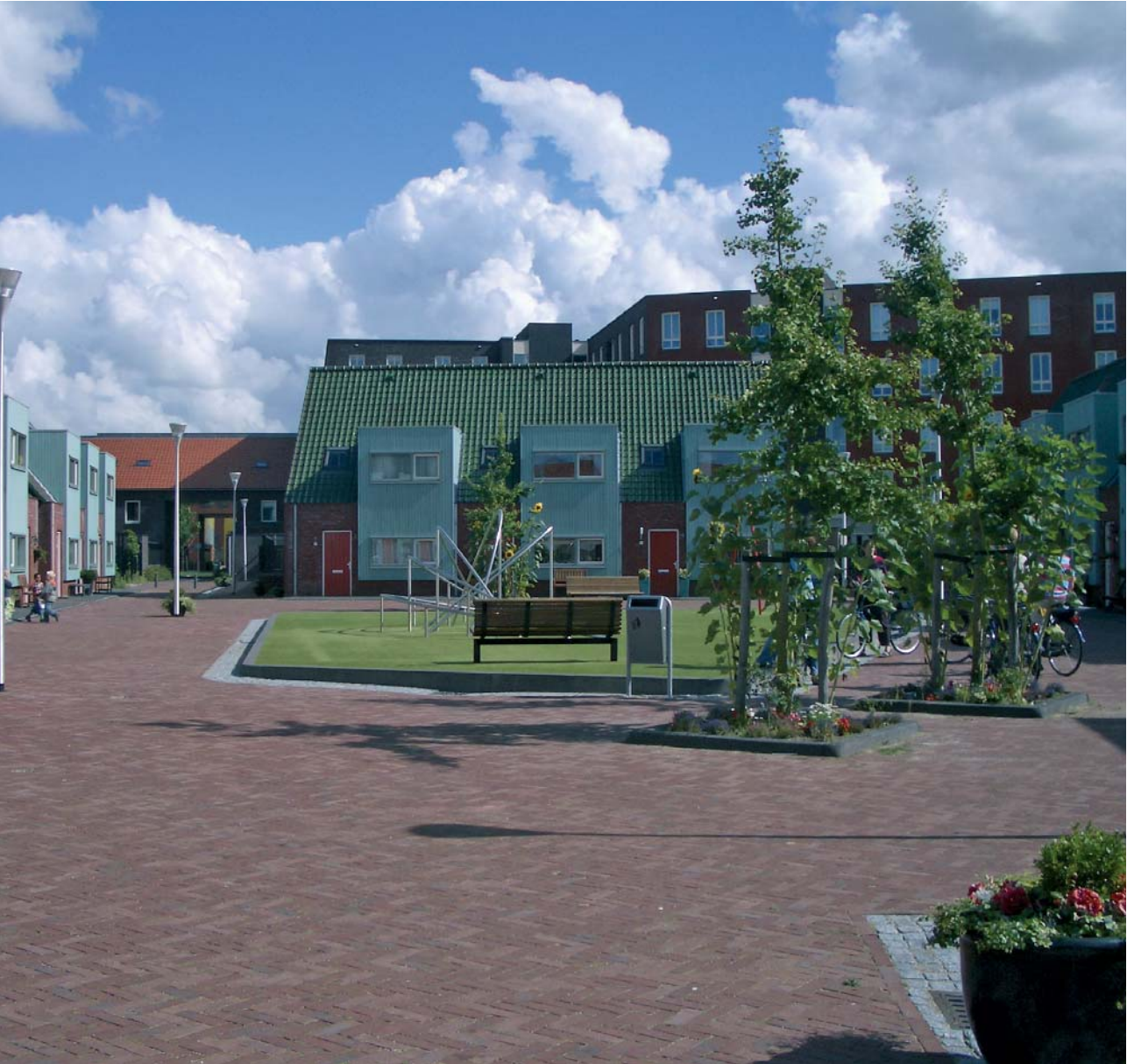
This area of new housing in Rijswijk in the Netherlands includes generous and easily accessible public space and play areas close to people's homes so that even young children can play outside safely.